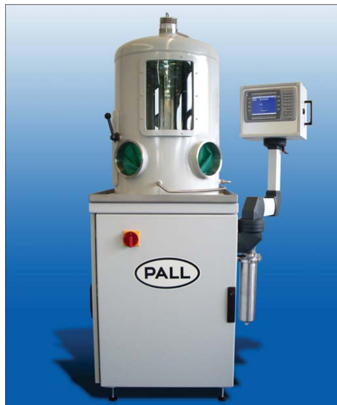
Pall PCC030 Cleanliness Cabinet

The residual fluid is passed through a high efficiency particulate removal filter and returned to the internal reservoir via a kidney loop/bypass filtration circuit for further use.